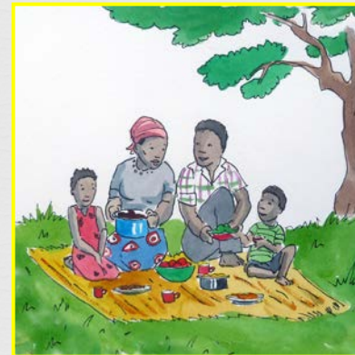
Feeding the Family