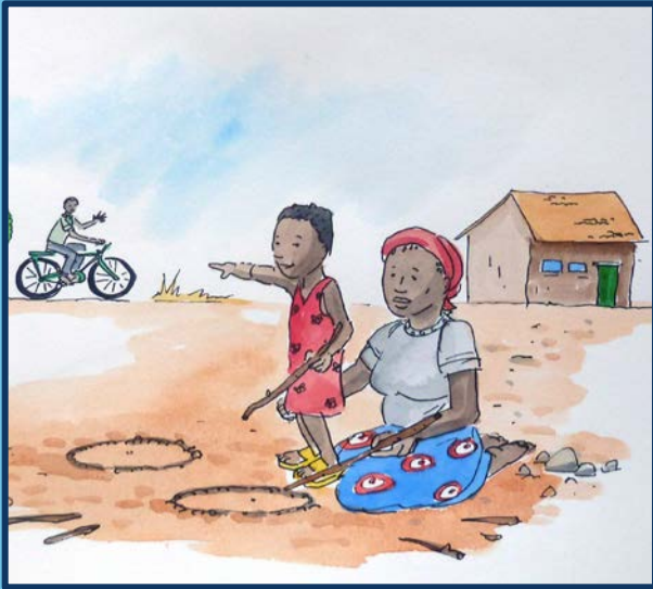
Circles, Circles Everywhere