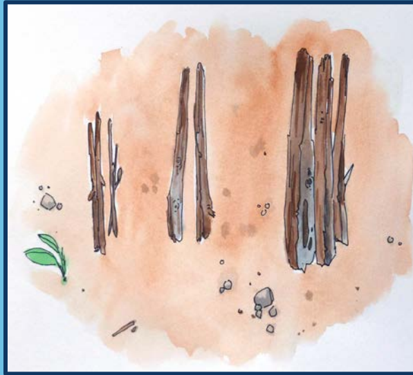
Which is longer?