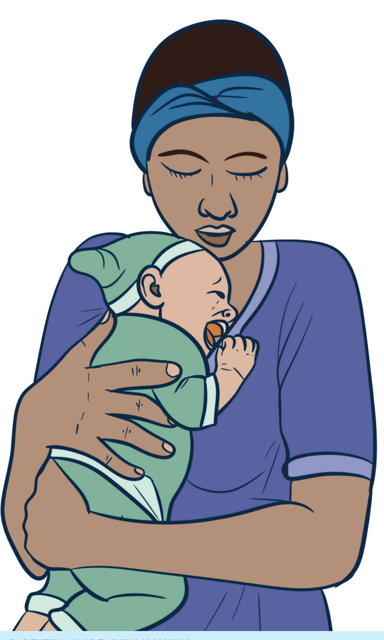
PARENTING /CAREGIVING/ MANUAL MAY 2024

Responsive caregiving helps children develop secure attachment and trust their environment.