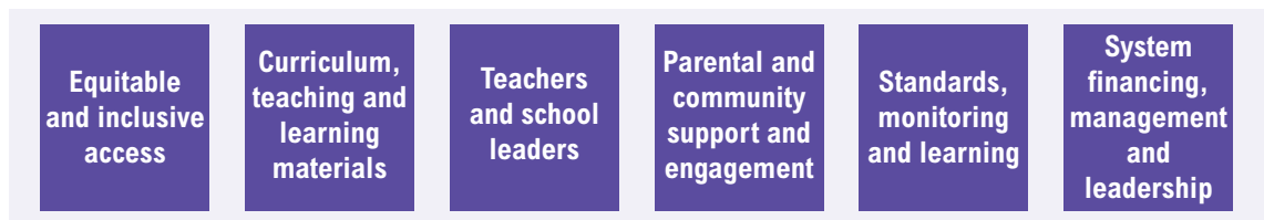
Figure 2. Six features of effective ECCE systems

The characteristics of effective ECCE, as expressed in the international literature, are many, but there is also consensus around the following six features of quality systems: equitable and inclusive access; curriculum; teaching and learning materials; teachers and school leaders; parental and community support and engagement; standards, monitoring and learning; and system financing, management and leadership (see, for example, the framework proposed in European Commission 2014).